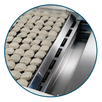
Optional Ceramic Coal on Stainless Steel Coal Screen